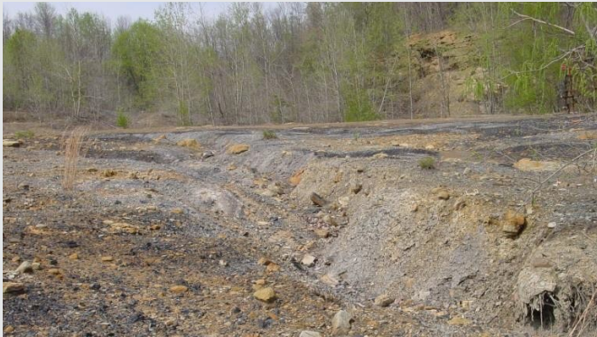
Exposed spoils are poorly vegetated and highly erosive.

Site Conditions: It has been established that the West Fork project was originally mined beginning in 1949 with mining continuing through 1965. Both surface and underground mining of the Meigs creek (#9) coal was conducted. Surface disturbances include 296 acres of unreclaimed spoil and gob, 5.9 miles of highwalls, and 8.3 acres of pit ponds.