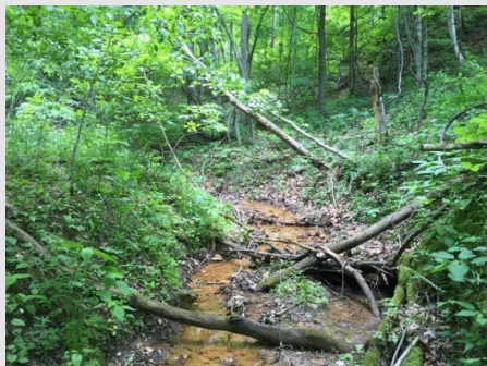
Monitoring Station D-20 not remined.

Monitored stream segment D-20 has an extremely poor habitat and the remining pH averages 4.5 S.U. The stream is stained orange by AMD and sediment impacts habitat quality. The remining project has not moved into this watershed. The HMFEI score of 5 reflects the poor quality of the stream. Monitored stream segment D-04 is downstream of permanent pond 004. Active mining was taking place in the watershed during the HMFEI biological assessment. The average during remining pH at this study segment is 6.97 S.U. and sediment is being flushed from the stream. The HMFEI biological assessment score is 15, demonstrating that the stream is in the process of recovery. The HMFEI score is anticipated to continue to improve with the completion of the remining project.