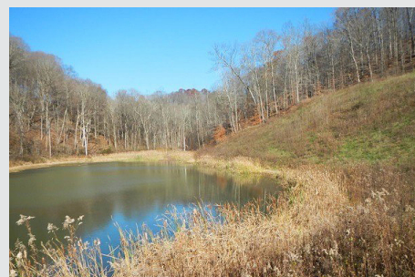
Permanent pond 002.