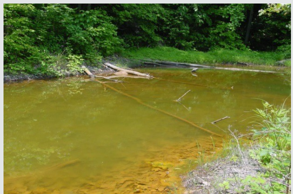
Poor water quality exhibited by orange staining.

The AMD formed within the West Fork Project provides the headwater source for the streams flowing from the project area. It is estimated that approximately 6.5 miles of unnamed primary headwater tributary streams are impacted by acid mine drainage originating in the West Fork project area. The headwater tributaries downstream of the project exhibit the orange staining indicative of acid mine drainage and are filled with sediment, which degrades aquatic habitat.