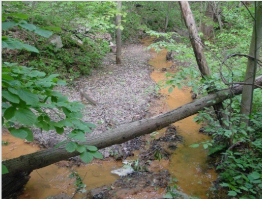
Headwater stream affected by acid mine drainage.