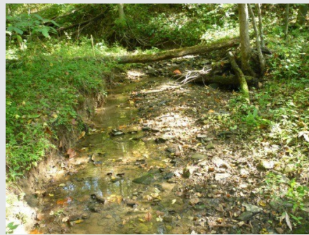
Monitoring Station D-04.