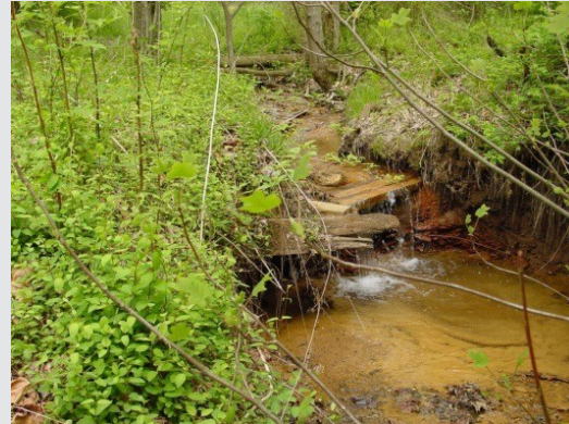
Poor water quality exhibited by orange staining.

Permitting: The original West Fork surface coal remining permit was approved in 2004 and the adjacent area remining permit was approved in 2012. Total permit area is 452 acres. The West Fork project meets the definition of “Lands Eligible for Remining” qualifying it for a US Army Corps of Engineers Nationwide Permit 49 for surface coal remining and an Ohio EPA modified effluent dischargers permit for the constructed sediment ponds.