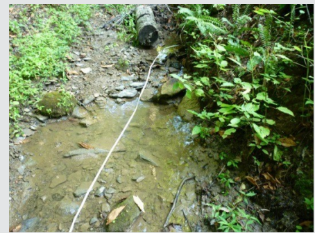
Monitoring Station D-03.

The monitored stream segment D-03 is downstream of permanent ponds 001 and 002. Mining has been completed in this watershed with the majority of the watershed under reclamation. The stream is in recovery. The average pH at this site is 7.3 S.U. and sediment has been flushed from the system. The HMFEI biological assessment score is 22 reflecting the improvement in water quality. It is anticipated that the biological community will continue to improve with time.