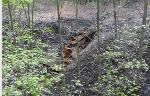
Erosion in spoil forms headwater of stream.

The grey, toxic, acid-forming spoils that cover the pit floor are highly erosive, contributing to erosion gullies. Vegetation is sparse due to the toxic nature of the spoils. Water that comes into contact with the spoil becomes acidic, forming acid mine drainage (AMD). AMD from the unreclaimed mine areas forms the headwaters of the streams that flow from the project area. During remining, exposed coal auger areas are removed; the highwalls and pits are backfilled and the spoils are graded, topsoiled, and revegetated. Through remining and reclamation of the AML, water quality on site and off site is improved.