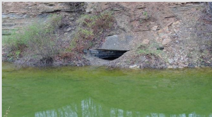
An auger hole is exposed along the highwall.

Water Quality Impacts: The majority of the pit ponds and seeps within the project area are acidic with pH values less than 4.0. S.U. is common. The severe acidity is due to exposure of water to acidic spoils, the exposed coal seam, auger holes, and deep mine voids. Auger holes and deep mine voids worsen AMD formation resulting in highly acidic pit ponds.